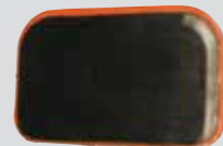
Rubber-faced pad (smooth black)