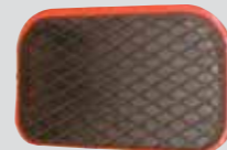
Rubber-faced pad (cross-grooved black)