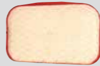
Rubber-faced pad (cross-grooved white)