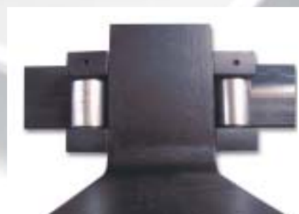
Lower sliding rollers (option)

The Bolzoni Auramo FP model fork positioner provides fast and accurate fork positioning as the forks operate on a round chromed bar. In addition to handling the usual palletised loads this unit allow to pick up cylindrical products such as drums and coils to be handled safely by ensuring stability.